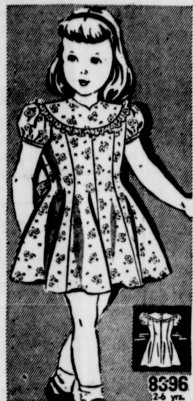
8396 2-4 yrs.