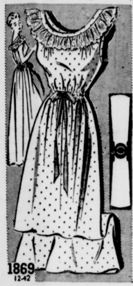
1869 12-42 Easily Sewn Gown

PRETTY enough for a trousseau is this lovely round-necked gown that's such easy sewing. Just four pattern pieces. A drawing waist makes it fit just right, lace sweetens the neckline.