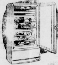
Model shown U.S. 9 Other models 7 and 11 cu. ft. from $200.00

New Deluxe Frigidaire with bigger Super-freezer chest HERE NOW!