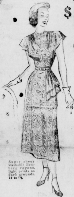
Super-sheer washable Bemberg rayons. Light prints on dark grounds. 14 to 24.

Make it the brightest, gayest Spring ever, with Easter-pretty prints. Gigantic collection of flattering styles to wear now, all summer long! Fine quality Bemberg sheers, printed rayons, Butcher linens, and 100 denier rayon crepes are long-wearing favorites always smart, suitable!