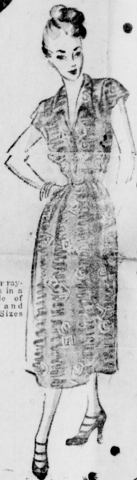
100 denier rayon crepes in a multitude of colors and prints. Sizes 14-20.