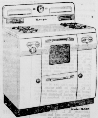
Only NORGE Gives You This Combination of Ultra-Modern Conveniences