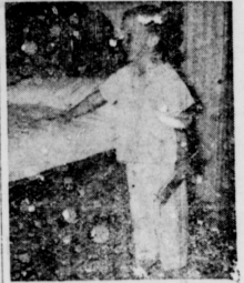
Ready for Stumberland.

"Appliqued cherries and red embroidered rickracks give accent to these chic mother-daughter outfits," this Capper's Farmer expert writes. "Rough-weave, bleached cotton sacks were used. When preparing the sacks for sewing, rip the stitching and remove any printing by soaking them overnight in thick soapuds. In the morning wash them in warm, soapy water, rubbing printed parts between the hands. If this does not remove all marks, boil