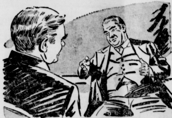
Are there people who can't give you a straight answer?"

Answer: Yes. You will meet people who find it almost impossible to make a direct statement, even about the weather. It may be because as children they were criticized or punished so severely when they tried to do things on their own initiative that they dare not take a definite stand on anything whatever. Or they may be temperamentally "ambivalent" (facing both ways emotionally) and so obsessed by their inner contradictions that they cannot see one side of any question without being conscious that perhaps there is another.