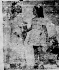
Che Frocks for Warm Weather.

In addition to useful information on styles, wardrobe replenishment and sewing, women readers of Capper's Farmer regularly find interesting features in the magazine on cooking, child care, beauty, gardening and other topics.