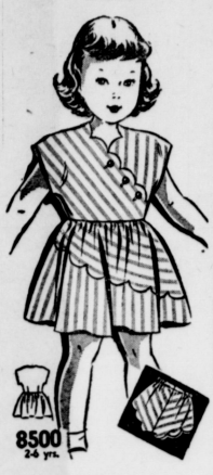
8500 2-6 yrs.