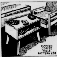
A Modern Coffee Table

IT IS 19 by 30 inches with a shelf open on both sides for greater convenience. Its modern lines are so simple that it harmonizes in a strictly modern setting or when used with Early American pieces.