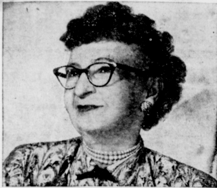
Another prize-winning cook praises New Dry Yeast

SO FAST..PURE..DEPENDABLE St. Joseph ASPIRIN WORLD'S LARGEST SELLER AT 10¢