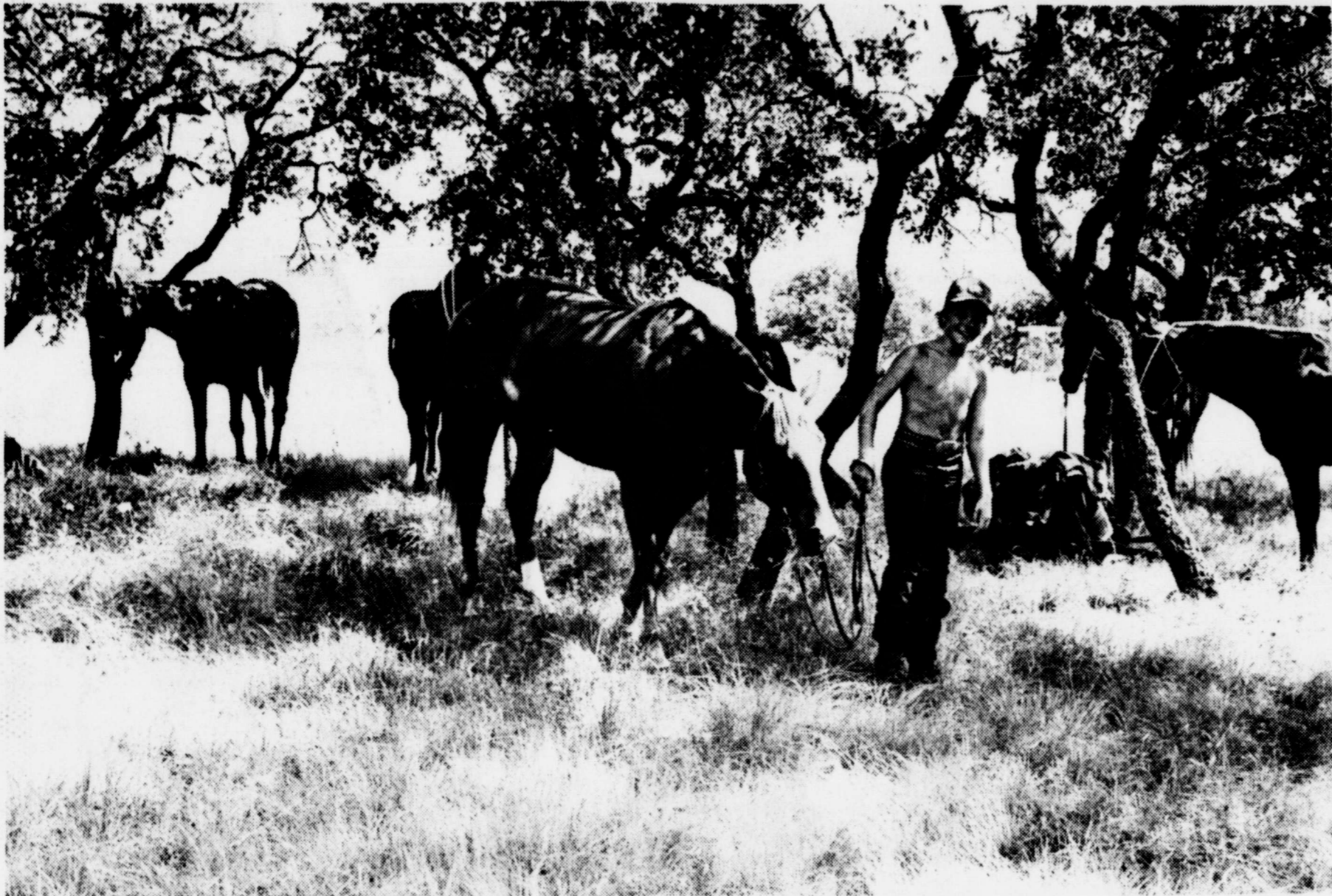
DAY'S END —A young trail rider tends his horse after "poundin' leather all day long," as the Winters Riding Club Tuesday afternoon ended the first lap of their trail ride to Coleman,

where they were to take part in the parade before the annual Coleman Rodeo opened Wednesday night. The Winters riders left Winters early Tuesday morning, and bedded