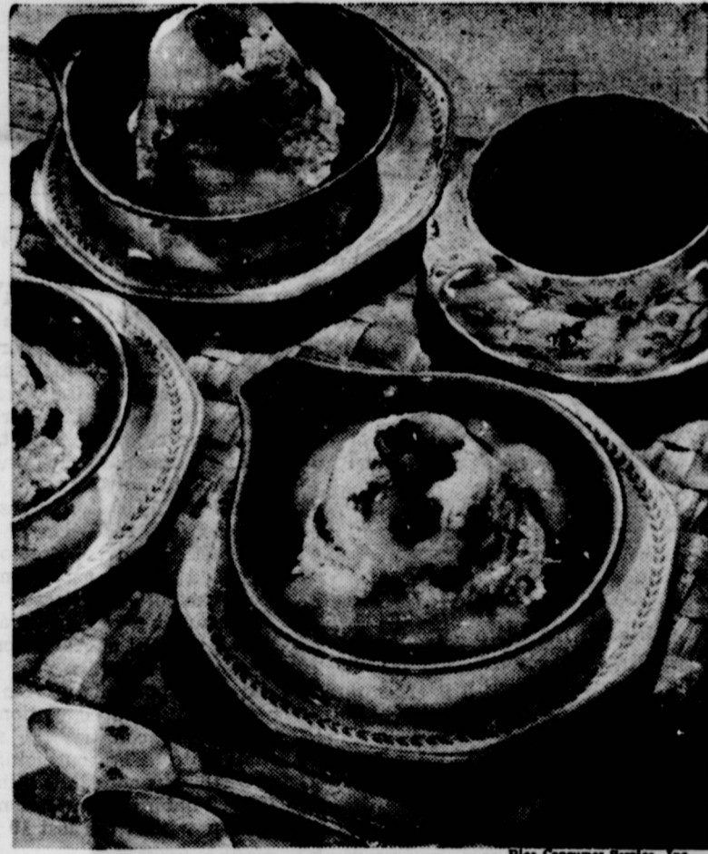
Rice Consumer Service, Inc.