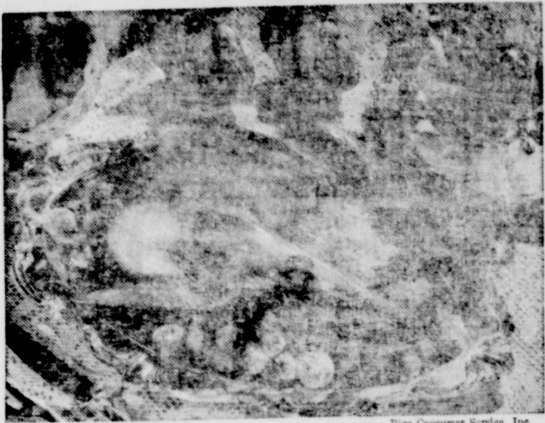
Rice Consumer Service, Inc.