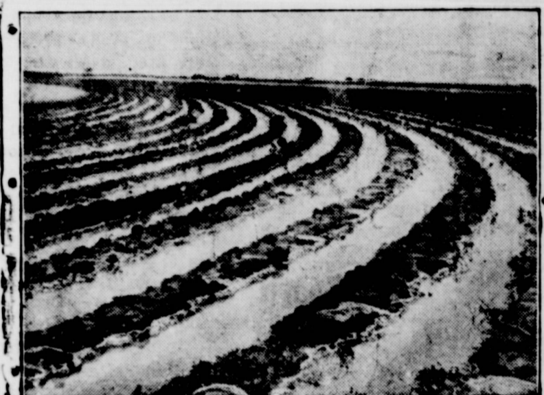
Farming on the contour together with the proper management of crop residue and stubble mulching help to hold water where it falls.

If bollworms are found on as many as five or six squares of bolls for each 100 examined the infestation is deemed high enough to warrant applying control measures.