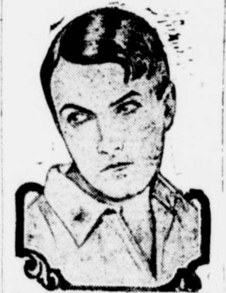
Richard Barthelmess in "Classmates" To Be Shown at Queen Theatre Soon