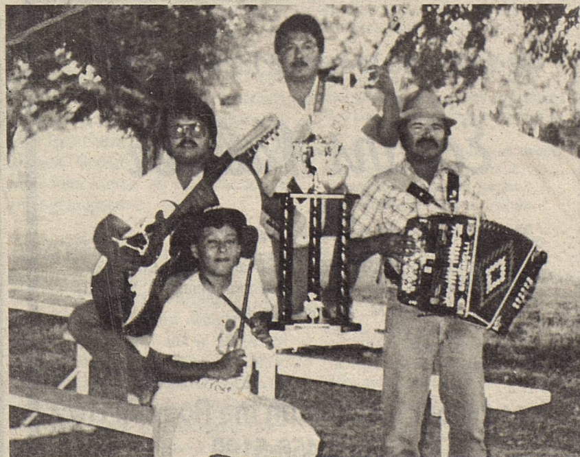
LOS CUATRO ACES

Children ages three years through fourth grade are invited. A closing picnic will be held Friday.