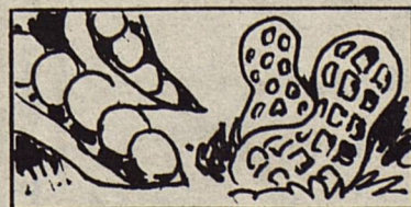
The peanut is not a nut—it's a legume.

Yoakum County & Surrounding Counties, tax included .....$15 Elsewhere, tax included .....$16