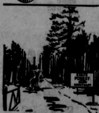
The Texas Forest Service administers four small state forests located near Maydelle, Comroe, Warren and Kirbyville. They are maintained to demonstrate cultural practices for continuous timber production, water conservation and as a habitat for wildlife. Self-guiding nature trails are available on each forest.