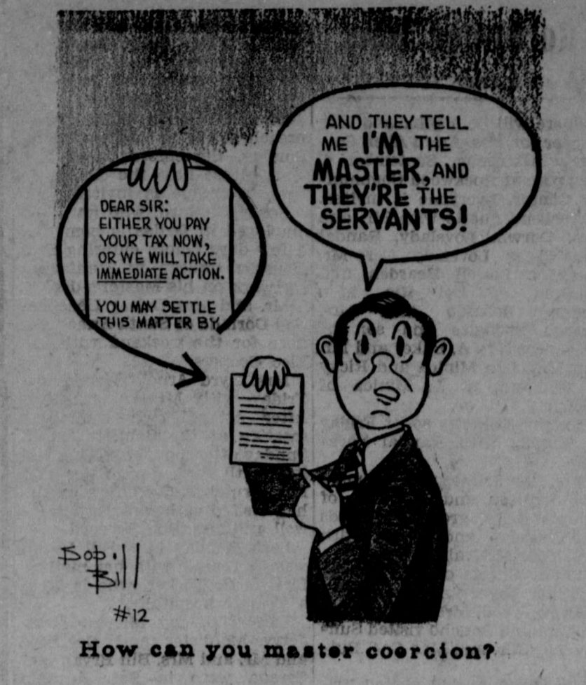
How can you master coercion?