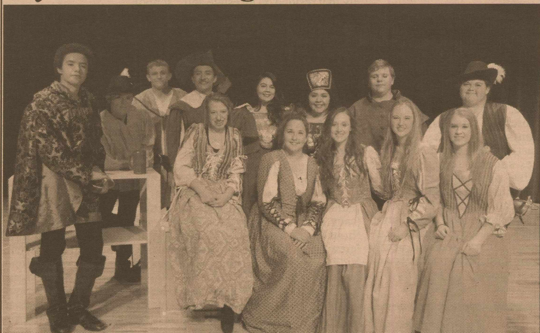
Advancing!! The Borden County One-Act Play are advancing on to Bi-District this Friday at Borden County at 7 p.m. Also advancing was Hermleigh and Westbrook!!