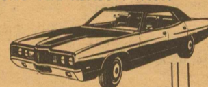
LTD Brougham 4-Dr Hardtop

WE'RE PROUD OF OUR SERVICE DEPARTMENT HERE AT BOB BROCK AND WHEN YOU BUY FROM US YOU ARE ASSURED OF "SERVICE AFTER THE SALE"