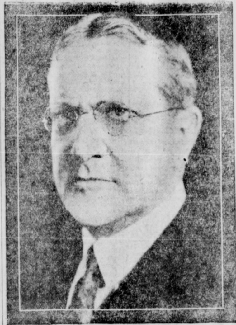
SENATOR GEORGE MOSES