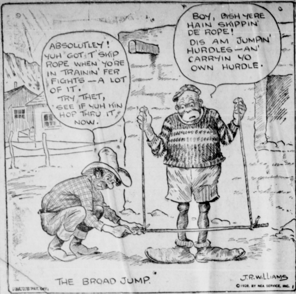
THE BROAD JUMP.