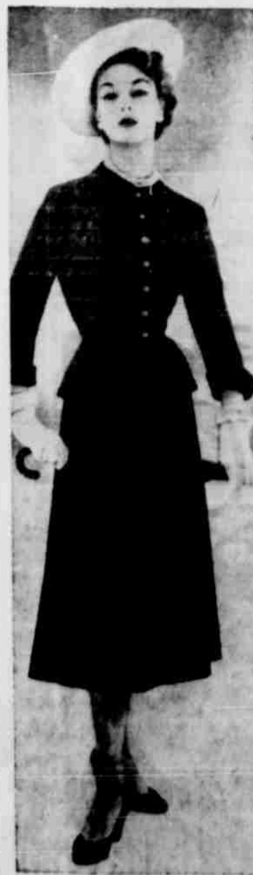
GADABOUTS—Wool jersey lined in taffeta is a new favorite for warm weather travel. Packable and travel-wise are the three outfits pictured, all in wool jersey by Wynne. Left, navy jersey suit with bright blue taffeta jacket lining and underskirt, by LoBal.