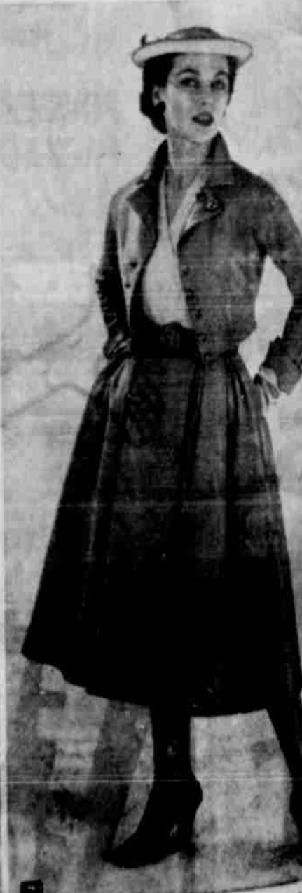
bo; center, voluminous flared travel coat in heather jersey, taffeta lined; right, cork colored globetrotter suit designed by Greta Platry with wide brief jacket. The blouse and eta lining are pink.