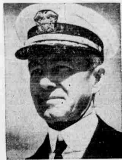
Admiral Thomas C. Hart, commander in chief of the United States Asiatic fleet since July 25, 1939, upon whom falls much of the burden of carrying the war to Japan in the Far East.