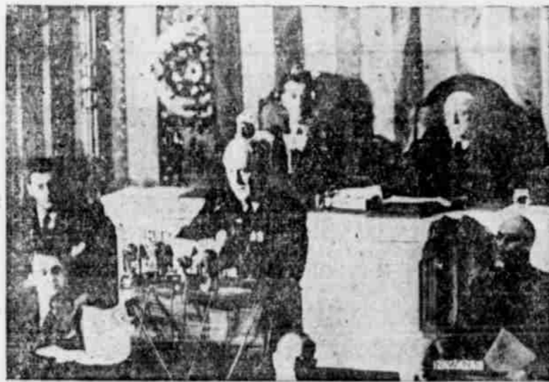
President Franklin D. Roosevelt addressing the joint session of congress, where he asked congress to declare a state of war against Japan thirty-three minutes after the President had concluded his speech congress had passed the resolution. There was but one dissenting vote. In the rear of the President is Vice President Wallace, Speaker Sam Rayburn; seated, at right, Capt. James Roosevelt.