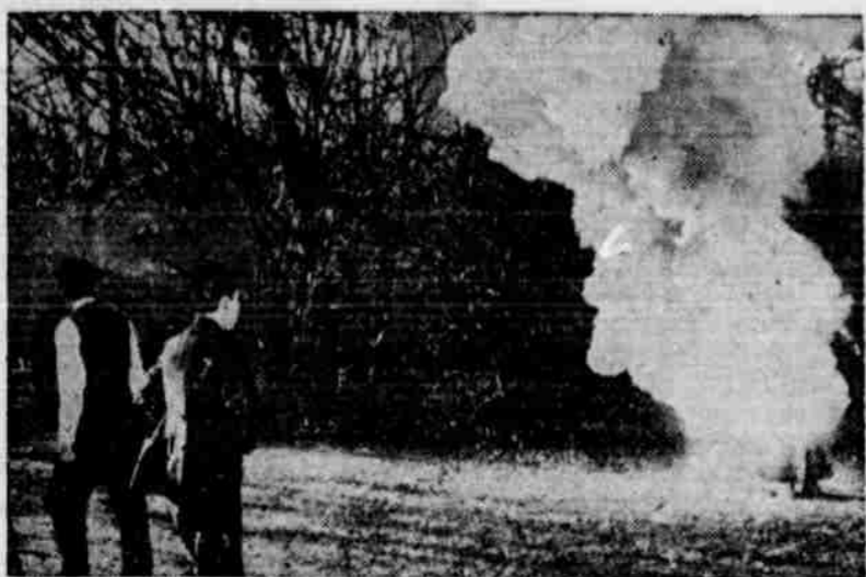
Members of the Japanese embassy staff are shown burning official embassy papers in the back yard of the Japanese embassy in Washington, D. C., to prevent seizure and confiscation by the U. S. government, shortly after the news of the bombing of the U. S. naval and army bases in Pearl Harbor reached Washington.