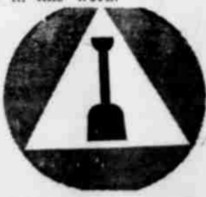
ROAD REPAIR CREW

The Staff Corps will be assigned to all types of administrative and office work. Men and women with executive ability and a knowledge of administrative procedure will be useful in this work.