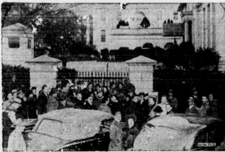
The first news of the Japanese bombing of U. S. naval and army bases in the Pacific to reach Washington brought crowds to the White House, where flash bulletins were being issued by the President's secretary, Steven Early. The photo shows crowds at the gate leading to the executive office of the White House.