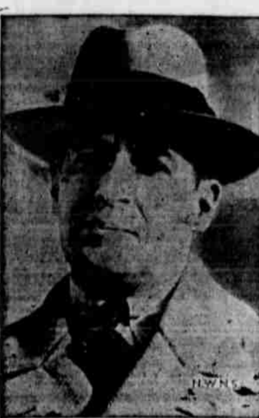
Lieut. Gen. Douglas MacArthur, former U. S. chief of staff, and more recently Field Marshal of the Philippine Islands, is now commander-in-chief of all the U. S. armed forces in the Far East.