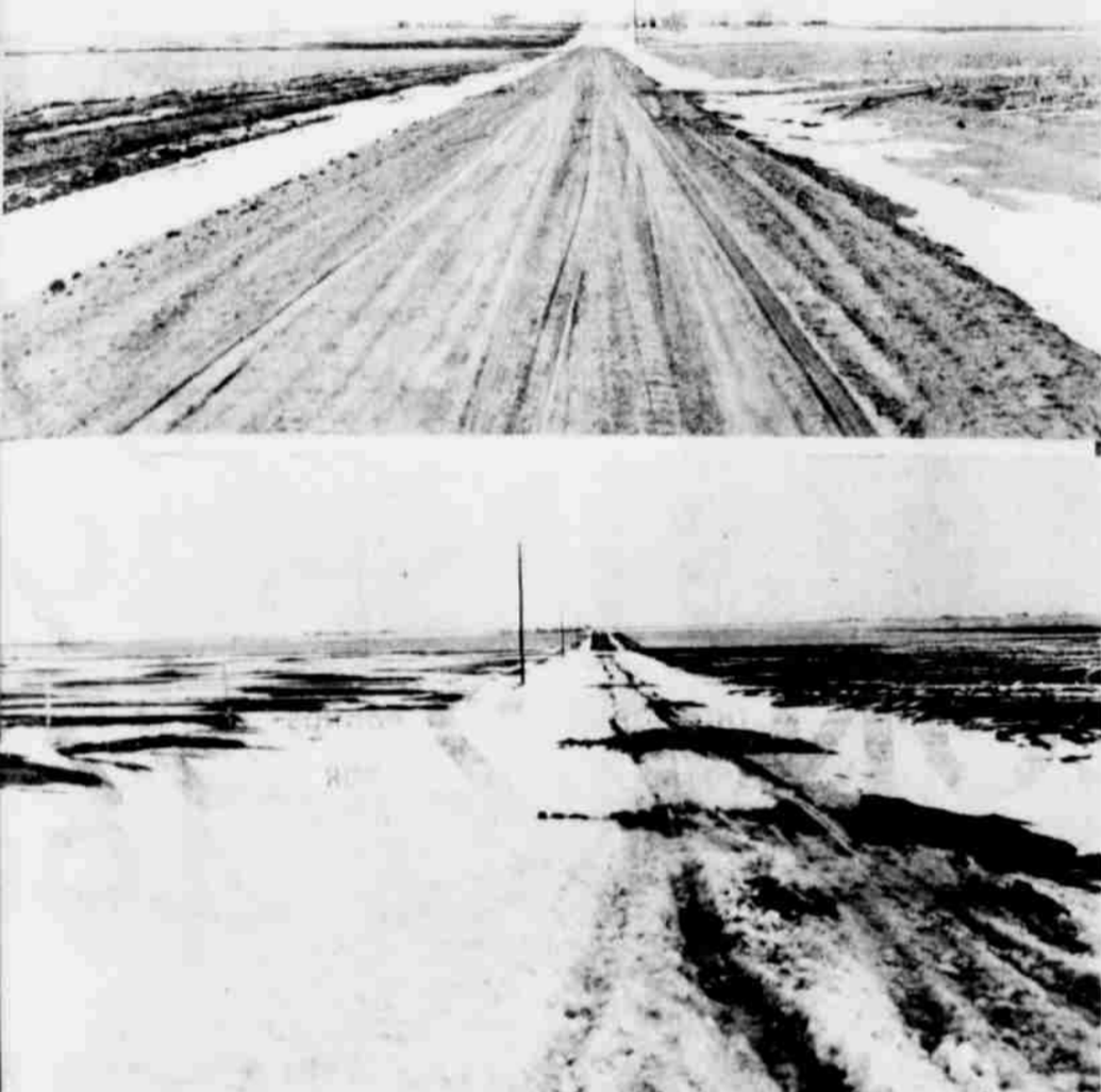
GOOD RESIDUE MANAGEMENT -- Pictured above are contrasting pictures showing good residue management on cropland in the picture at the top with the road clear. The picture on the bottom has had no residue management and the road is covered with snow making it slick and muddy. In the picture at the top the snow is kept on the field so that the moisture can be used to produce crops and not on the road to make it difficult to travel.