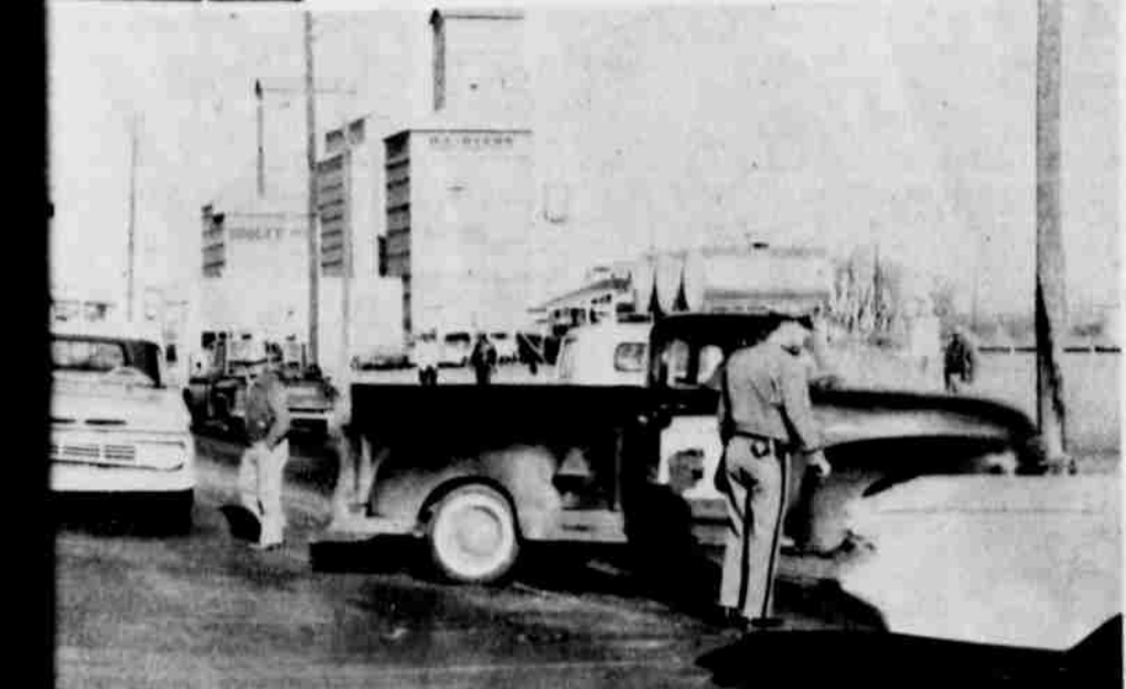
STREET, PLUS CARS, EQUALS ACCIDENT -- Five cars piled up early Thursday morning at the intersection of Phelps Avenue and Delano. Although only minor damage was done, in both directions was halted for a short time. The accident happened when the lead car attempted to make a right turn onto Phelps and the others following were to stop because of ice on the road.