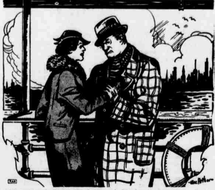
"Good bye, Angela," said Macduff, and his heart was strangely heavy.

Borneo, the leopard skins of Darjeeling, the mandarin robes of China, and was landing empty-handed. He turned on all the lights, to shake off the feeling that he had been staring for hours into a darkened cave. The sea rolled smoothly under the porthole, but the night was black and moonless. With an effort he forced the dead girl out of his thoughts. In a few hours now he would be back in Gramercy Park. Angela would be