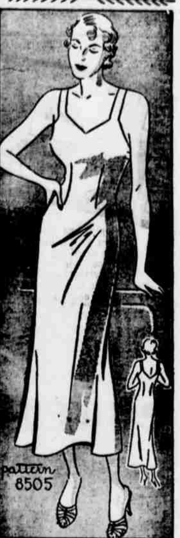
Designed in Sizes: 34, 36, 38, 40, 42, 44, 46, 48 and 50. Size 36 requires 3 1-8 yards of 39 inch material.

SLIM-FITTING SLIP Pattern 8505: Slim and well-made foundation garments are a necessity to every woman whatever her age or size, but the large woman particularly needs to have her lingerie smooth and form-fitting so that the chic appearance of her gowns will not be marred by "bunchy" undergarments. The clever and modish slip shown in the sketch is so well designed and sensible that it will appeal to every woman. The built-up shoulder, for instance, is extremely comfortable (the straps never fall off). The moderate V of the neckline makes it possible to wear under most any frock except the backless evening frock. It is form-fitted by means of bust and waist darts and the skirt has sufficient width for comfortable walking.