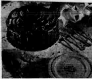
Tender, moist lusciousness characterizes chocolate cakes made with baking soda. Bake one for a festive Easter celebration.

EASTER CAKE 2 cups sifted cake flour 1 teaspoon baking soda 1/2 teaspoon salt 1/4 cup vinegar 3/4 cup milk 1 teaspoon vanilla 2 eggs 1 1/2 cups sugar 1/2 cup shortening 3 squares chocolate, melted Set oven at 350° F. Line 2 8-inch layer pans, 1 1/4 inches deep, with waxed paper. Grease waxed paper lightly. Sift cake flour onto a piece of waxed paper. Measure 2 cups. Place in sifter. Add baking soda and salt. Set aside. Mix together vinegar, milk and vanilla. Set aside. Put eggs and sugar in large mixing bowl. Beat for one minute, about 125 strokes. Sift in flour mixture. Add shortening and one-half of milk mixture. Stir until flour is moistened. Beat vigorously one minute. Add remaining liquid and chocolate. Beat one minute. Turn into prepared pans. Bake at 350° F., 30 minutes. Cool in pans on wire rack about 10 minutes. Turn out on cake racks and remove paper. When cold, brush off crumbs. Place one layer on cake plate bottom side up. Spread with your favorite frosting. Cover with second layer top side up. Frost sides then top of cake.