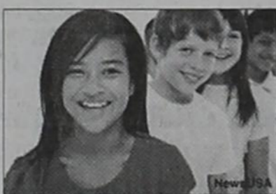
If you have a preteen or teen, make sure they receive proper vaccinations.

Want to learn more about the vaccines for preteens and teens? Check out www.cdc.gov/vaccines/teens or call 1-800-CDC-INFO.