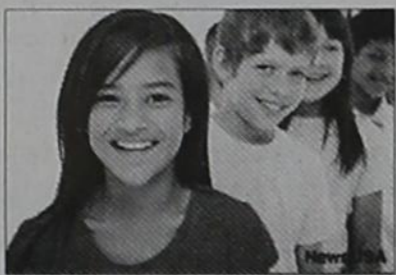
If you have a preteen or teen, make sure they receive proper vaccinations.

ria and pertussis. Pertussis, or whooping cough, can keep kids out of school and activities for weeks. It can also be spread to babies, which can be very dangerous and sometimes deadly.