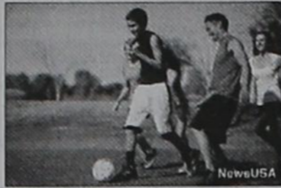
Tips for avoiding sports injuries include treating pain at first sign.

(NU) - Basketball and bicycling rank highest for injuries among recreational sports, causing 1.5 million accidents per year. Baseball, soccer and softball follow, each with almost half a million injuries yearly, according to the U.S. Consumer Product Safety Commission.