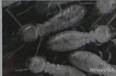
Termites cause billions of dollars in property damage every year.

(NU) - While you're trying to find every available reason to be outside this spring, termites are doing the exact opposite - trying to worm their way indoors and devour your walls and floors. And they certainly aren't feasting for free.