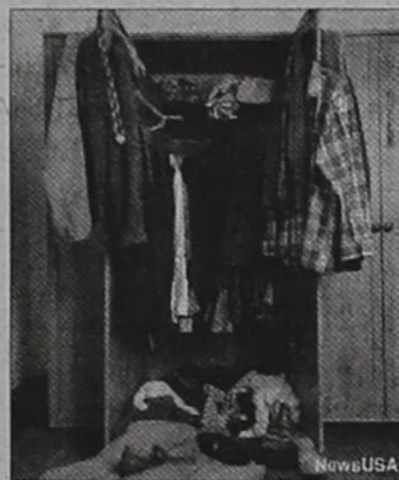
Spring cleaning is your opportunity to put a stop to overflowing clutter.

Taking the time to get organized can make all the difference - and it can make the most cluttered closets and dirtiest corners a breeze to clean. With the right tools in hand, organizing any messy space becomes a manageable task. You can save time and money by getting cleaning supplies, like dusters, sponges and automated air fresheners, at places like Dollar General.