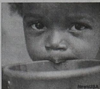
Access to safe drinking water saves lives.

The Pantene HHHW initiative is part of Pantene's ongoing commitment to making meaningful improvements in sustainability through its products, operations and social responsibility programs.