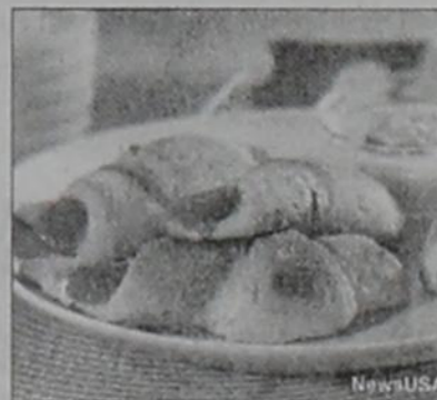
Texas Reds in a Blanket is an easy recipe to make with kids.

place on paper towels to remove excess moisture. Set aside.