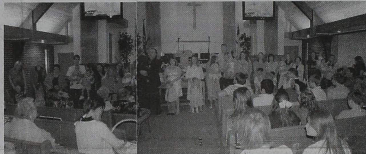
Baby and Child Dedication 2010 (23 babies and children in attendance)

2010 Senior Mexican Supper (14 Seniors in attendance)