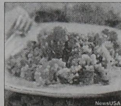
Quinoa and grapefruit make for a healthy, tasty combination.

saucepan over medium heat. As soon as the oil starts to bubble, remove from heat. Set the oil aside to steep for 30 minutes. Strain and reserve the oil.