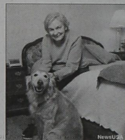
Many needy seniors will go without food in order to feed their pets.

(NU) - During a tough economic climate, it can be a stressful time for many homebound seniors, if not for their pets. Many seniors, when strapped for resources, choose to feed their pets instead of themselves. This means neither the pet owner nor the pet get the nutrition they need to stay healthy.