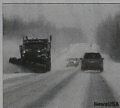
Getting your car serviced before holiday travel season can help ensure safe travel on snowy, icy roads.

mas, certificates of advanced course work, and certification by ASE indicate the presence of professional, trained technicians. • Look for the ASE sign. ASE was founded in 1972 to improve the quality of automotive service and repair through the voluntary testing and certification of automotive professionals. ASE-certified technicians wear blue and white ASE shoulder insignia and carry credentials listing their exact area(s) of certification, while their employers display the blue and white ASE sign. • Be ready to describe any changes in your vehicle's handling or performance or other issues. Do not be embarrassed to ask for simple definitions for any technical terms you find unfamiliar. • Reward good service with repeat business and customer loyalty.