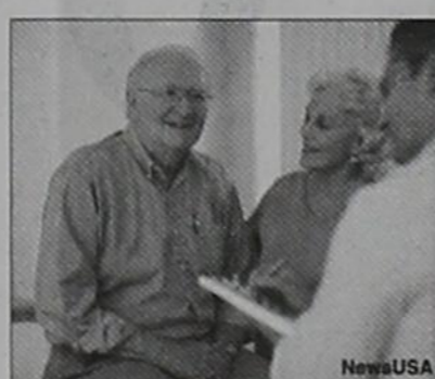
Speak to your health care professional for answers about pain or discomfort.

While pain can affect anyone regardless of gender, race or economic status, some people have difficulty getting adequate pain care. It is important that people