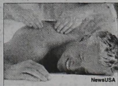
Sports massage can help athletes recover more quickly from workouts.

(NU) - Many Americans focus on the active part of exercise - lifting more weight or running more miles. But you build muscle during recovery, not while you're exercising. For this reason, athletes of all levels are starting to pay exercise routines and recovery periods equal attention. And for many, sports massage has become a vital tool in the recovery process.