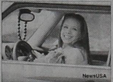
An inspection can help you avoid purchasing a car with mechanical problems.

(NU) - As the summer comes to an end, teens prepare to get back to the classroom - and the road. If your young driver is ready to buy their first used vehicle, you'll need to do your research. Firestone Complete Auto Care offers some tips that will not only help you in the process of buying a good used vehicle, but will also help keep that vehicle running newer, longer.