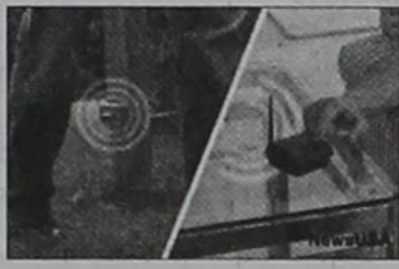
A new wireless motion alert system alerts homeowners to guests or potential intruders approaching their property.

Created by Chamberlain, the world's largest garage door opener manufacturer and leading do-it-yourself access control innovator, the CWA2000 Wireless Motion Alert system allows homeowners to safely monitor