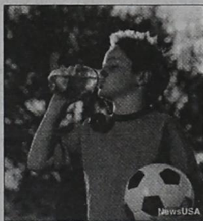
Make sure that child athletes stay hydrated during practice as well as at games.

And children should wear the same equipment for practice as they do at games.