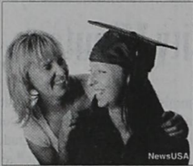
For your graduate, find a gift that has meaning or intrinsic value.

Maker Plus also makes custom desk plates.