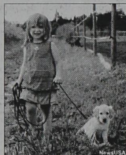
Avoid walking pets in tall grass - it can hide ticks.