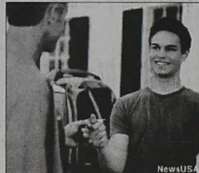
Before parents let their teens drive, it is vital to discuss the importance of vehicle maintenance.

Engine oil level. Teaching your teens to maintain a proper oil level is the single most important thing you can do to help extend the life of the engine in their vehicle. If an uninformed teen al-