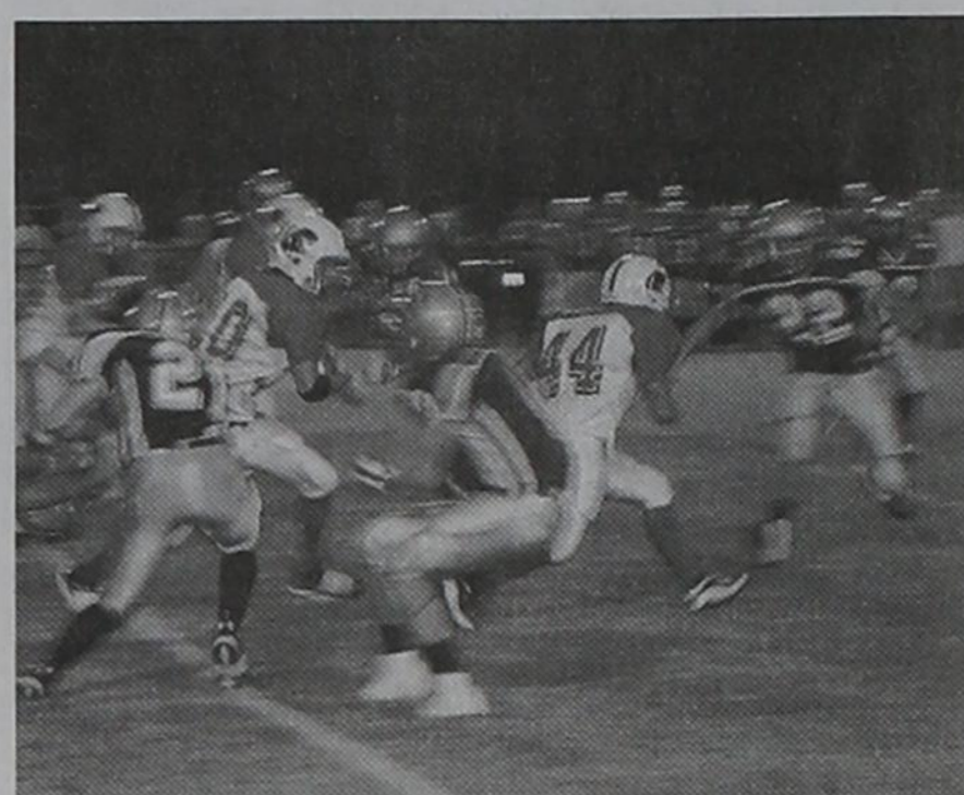
FOLLOWING BLOCKERS – Matt Underwood is shown trying to follow blockers in game action Friday.

The Panthers held the Pirates on their next possession but couldn't must a drive. They punted to the Pirates, who got the ball on their own 27 and in one big pass