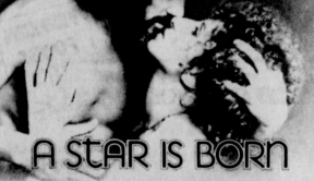
A STAR IS BORN

15 MINUTE INTERMISSION BETWEEN 1st & 2nd SHOW