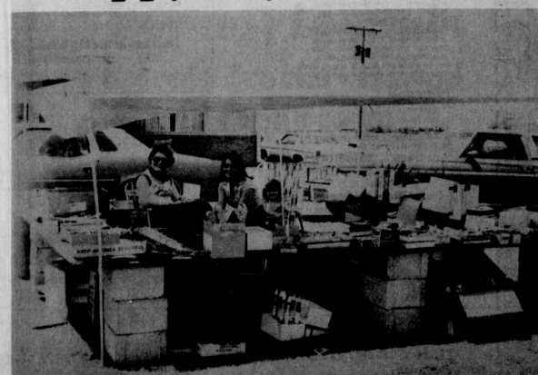
These ladies appear to be enjoying themselves. They're actually "tendin' the store" for the Rho Rho fireworks stand in front of Horizon Oil on the Borger Highway.