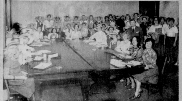
WIFE-LY GATHERING -- U. S. Sen. John Tower of Texas, standing at right near the table, is participating in a discussion with the WIFE delegation from Spearman, Gruver and other areas of Hansford County during the recent trip to Washington, D. C., to confer with the appropriate officials about the plight of the wheat farmer who is reaping financially less from his wheat farming efforts.