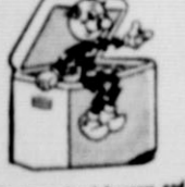
To keep head braces and hair bangs with soft through the hot, hot days. I've worked more hours day and night.