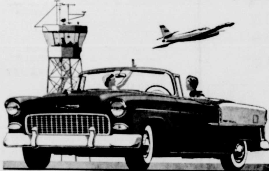
Drive with care... EVERYWHERE!