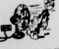
And your fans, big and little, help me keep your room cool and comfortable, bringing you cooling breezes toward the desk.