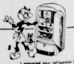
I saved your refrigerator longer hours for me... and added jobs. For when the temperature soars there's much, much more work for me to do in addition to my regular chores... work that I'm glad to do so long as it's helping you.