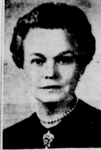
Mrs. Oveta Culp Hobby of Houston, who served as the nation's first secretary of Health, Education and Welfare in the President's Cabinet, will receive the State Fair of Texas' first "Woman of the Year" award Oct. 19, Women's Day at the 1955 Fair. The award will be presented annually in recognition of constructive achievement of national importance.

led with simple steps and nominal costs.