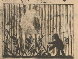
Some people believe it best to plant corn in the light of a full moon.