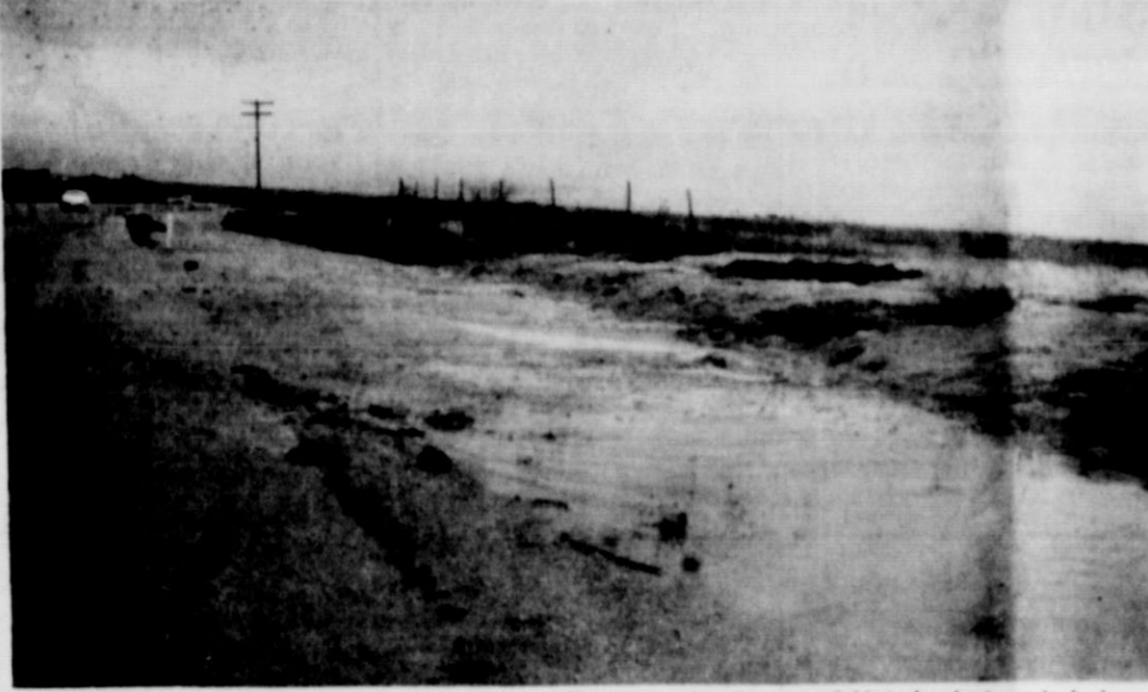
TOO WET TO PLOW as water rushed from a field immediately east of Matador last week during a heavy rain. Here in Matador a total of 5.83 inches has fallen since the first of the year, with 4.45 inches falling within the last ten days.