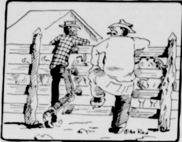
Shore they're registered Four different banks have papers on em!

This feature sponsored by THE FIRST STATE BANK