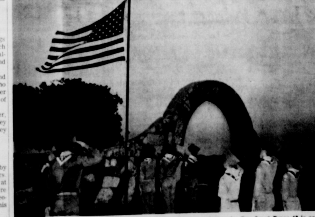
A SCOUT IS LOYAL, A SCOUT IS REVERENT. Members of Matador Boy Scout Troop 60 in salute to the flag at East Mound Cemetery, during the Memorial Day observance last week, which was conducted by the V. F. W. and American Legion.