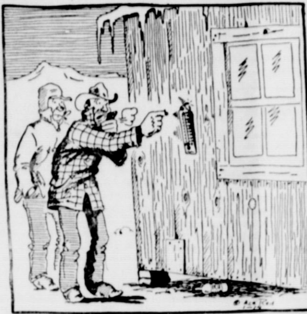
Golly, the temperature's droppin' so fast it's pullin' the thermometer off the wall!

This feature sponsored by THE FIRST STATE BANK