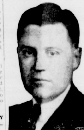
WHY VOTE FOR JUDGE RALPH YARBOROUGH FOR GOVERNOR?