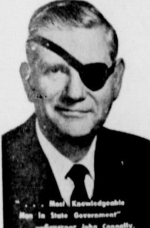
One man stands tall as THE qualified candidate in the Attorney General's race. He is so obviously the best choice that more than 75 newspapers have endorsed him over two young opponents.