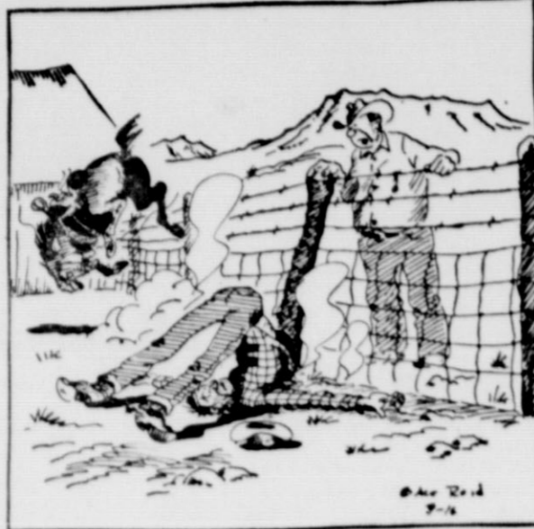
"All right clumsy, now you're gonna have to re-set this post and re-stretch the wire!"

This feature sponsored by THE FIRST STATE BANK