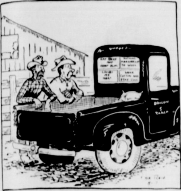
Can't get into the hog business until I get room for the sign.

This feature sponsored by THE FIRST STATE BANK