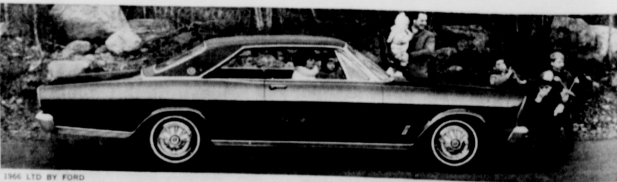
1966 LTD BY FORD

(With our family the quiet doesn't mean much. But it's nice to know the quality's there.)