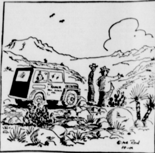
"Sure there's plenty of grain—there's something like 12 varieties of grasses and maybe a poison weed or two."

This feature sponsored by THE FIRST STATE BANK