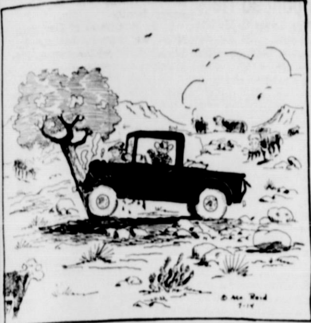
"Aw, that dang tree, now I ain't sure if the count wuz 78 or 88 cows!"

This feature sponsored by THE FIRST STATE BANK