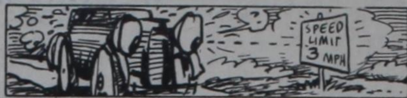
The first motorist convicted of speeding was going a mere two mph back in 1896.