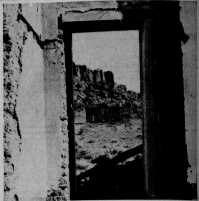
FRONTIER DEFENSE—Texas history is relived at old Fort Davis, key post in the defense system of West Texas from 1854 to 1891. Today the remains of Fort Davis are more extensive and impressive than those of any Southwestern fort. Visitors can inspect many officers' residences, troop barracks, warehouses, and the hospital.

Fifteen states have daylight saving time throughout the state, 16 allow local option and the remaining 19 make no provision for daylight saving time or prohibit it.