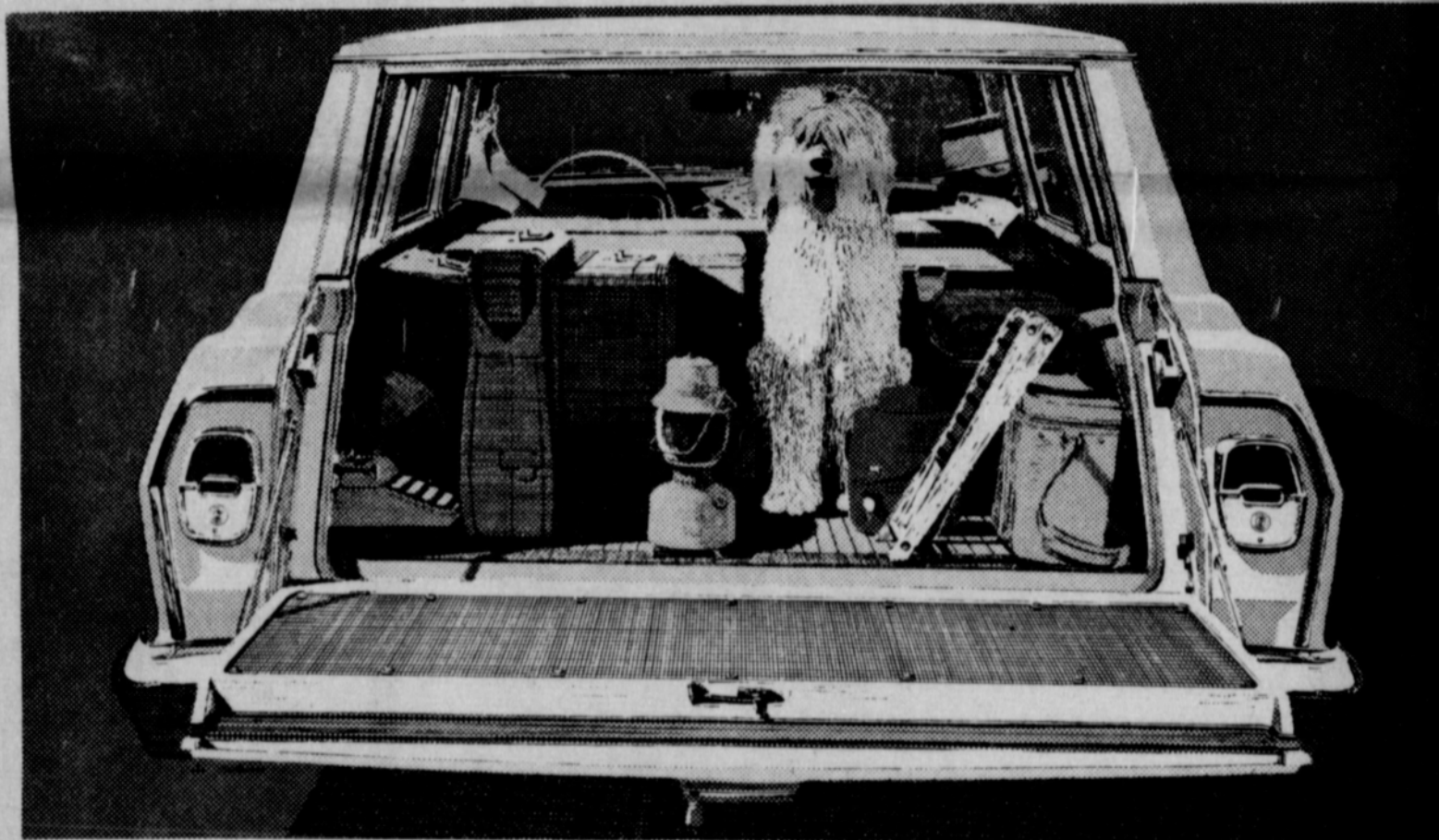
Chevy II Nova 400 6-Passenger Station Wagon

A Chevy II wagon looks this big when you load it up