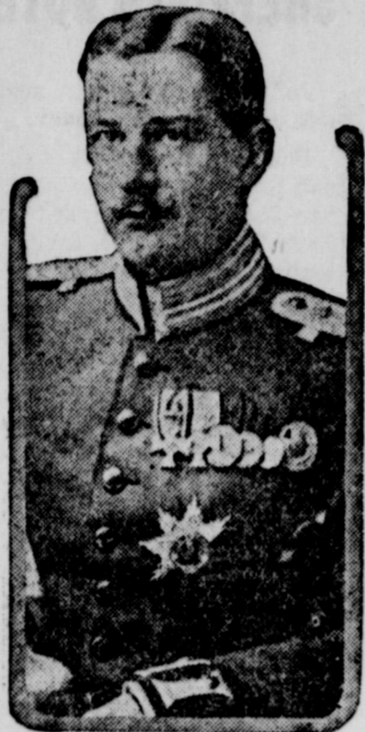
According to advices from Europe, the Kaiser has decided to make his second son, Prince Eitel Friedrich, king of Serbia. The prince has distinguished himself frequently during the war.